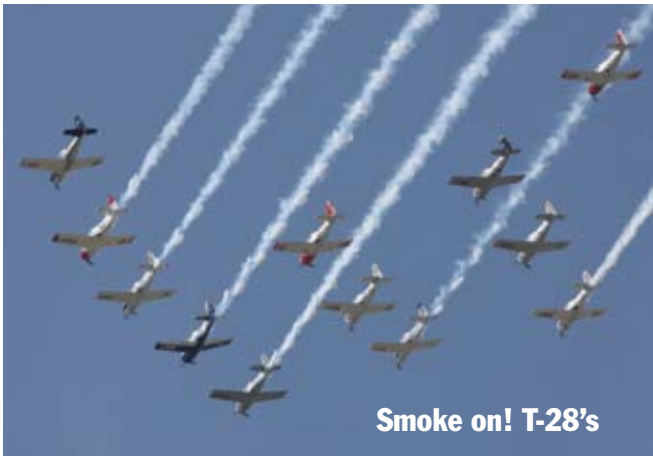
Smoke on! T-28's