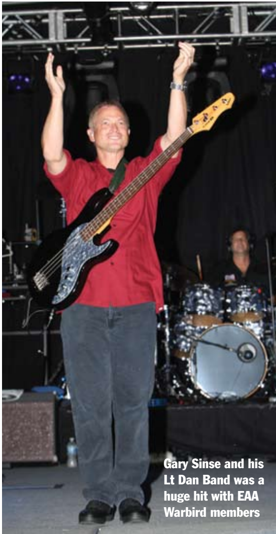
Gary Sinse and his Lt Dan Band was a huge hit with EAA Warbird members