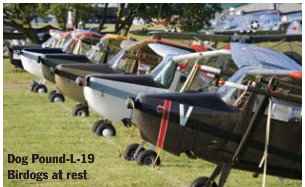
Dog Pound-L-19 Birdogs at rest