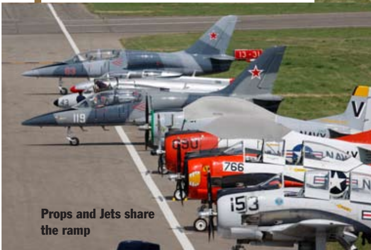
Props and Jets share the ramp