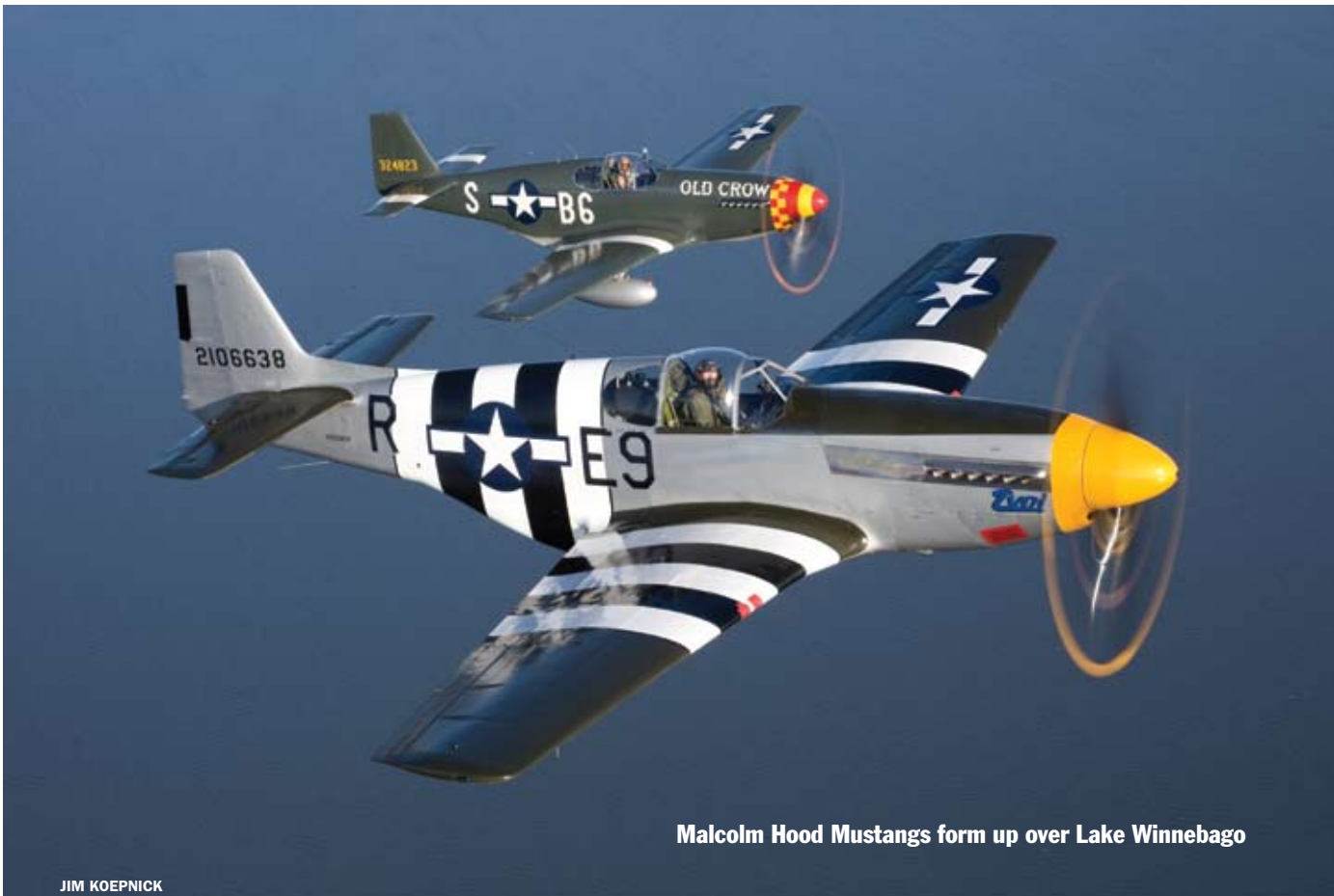
Malcolm Hood Mustangs form up over Lake Winnebago