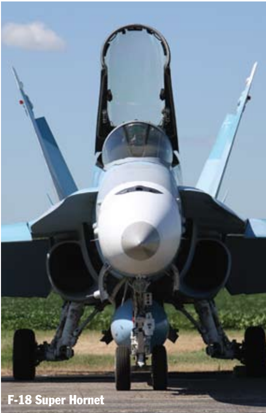
F-18 Super Hornet