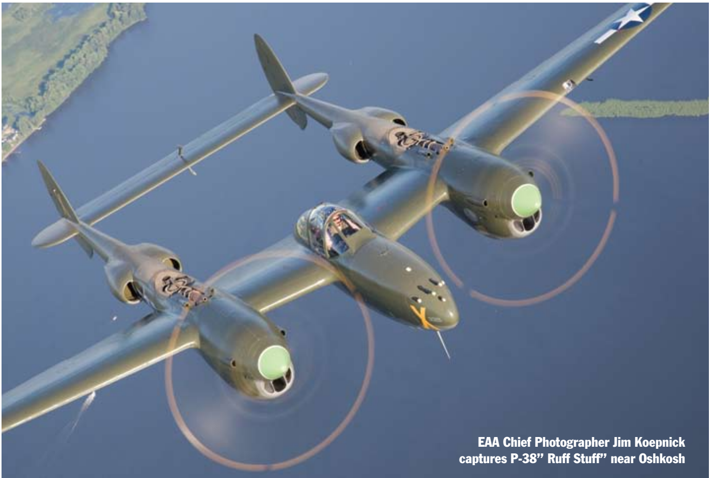
EAA Chief Photographer Jim Koepnick captures P-38 "Ruff Stuff" near Oshkosh