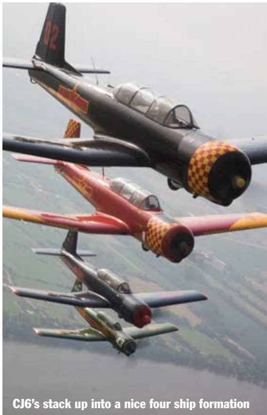
CJ6's stack up into a nice four ship formation