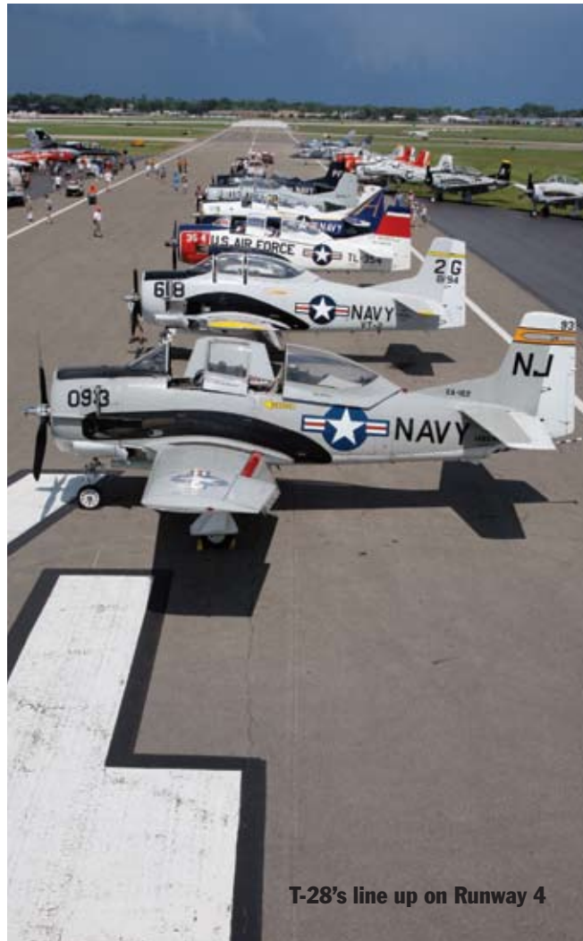
T-28's line up on Runway 4