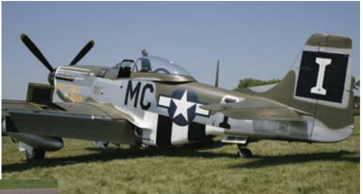
Grand Champion Happy Jack's Go Buggy