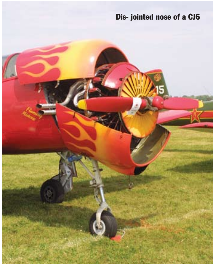
Dis-jointed nose of a CJ6