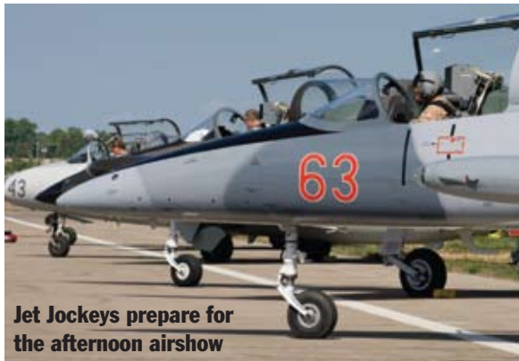
Jet Jockeys prepare for the afternoon airshow