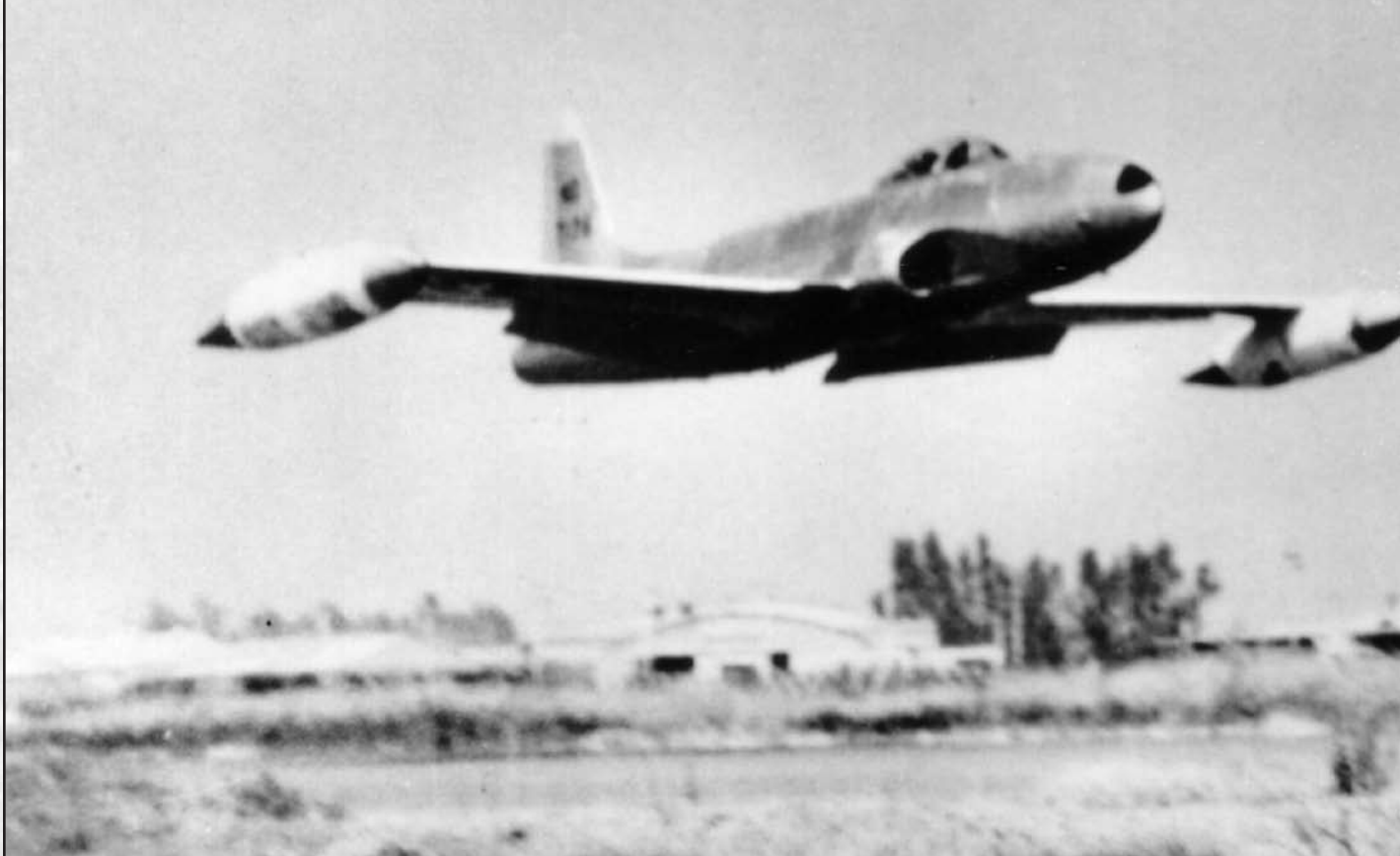
De Haven departing 1948: Maj. De Haven departing Long Beach Airport in a quest to post the fastest time in the 1948 Bendix Trophy Race.