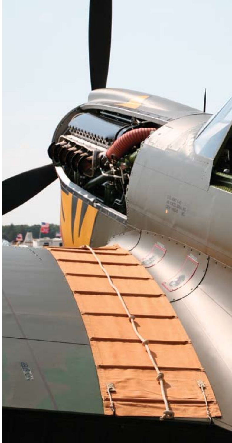
Upper Left: Fuselage interior details.